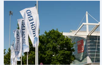
HIGH END signs in front of the entrance > picture download

Reprints free of charge – specimen copy requested