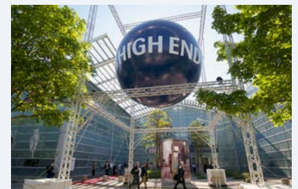
MOC in Munich > picture download